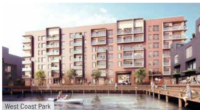
West Coast Park