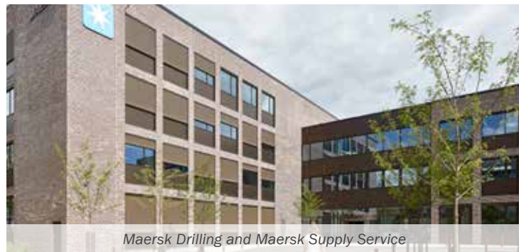
Maersk Drilling and Maersk Supply Service