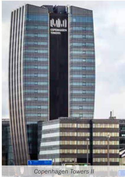
Copenhagen Towers II